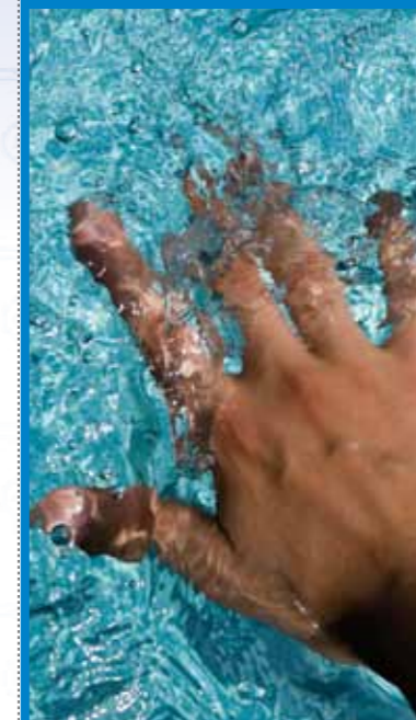
The bathroom as a living space

Everyone is talking about the „turnaround in energy“. Since the introduction of the Renewable Energies Heat Act (EEWG), branch professionals and end customers are confronting new requirements and possibilities. We invite you to obtain information on the state of the art of environmentally friendly efficiency technologies.