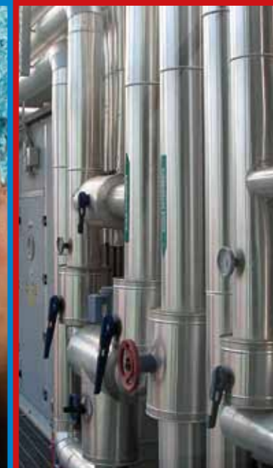
Economical heating technology