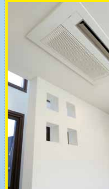
Well-being factor - room air